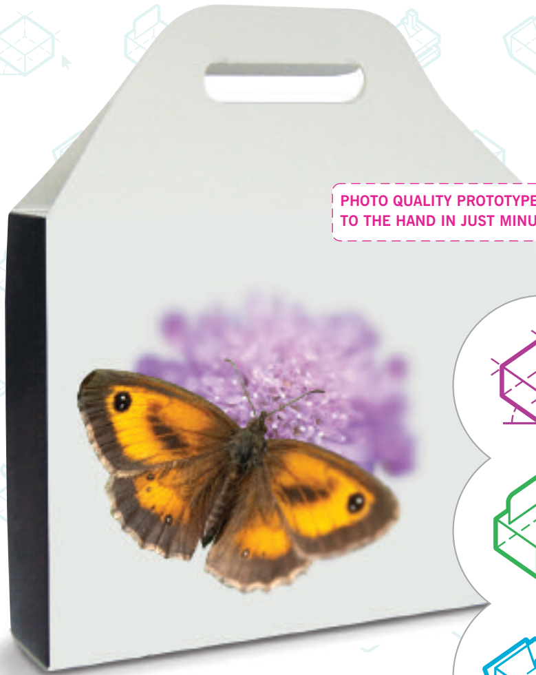
PHOTO QUALITY PROTOTYPES FROM DESIGN TO THE HAND IN JUST MINUTES